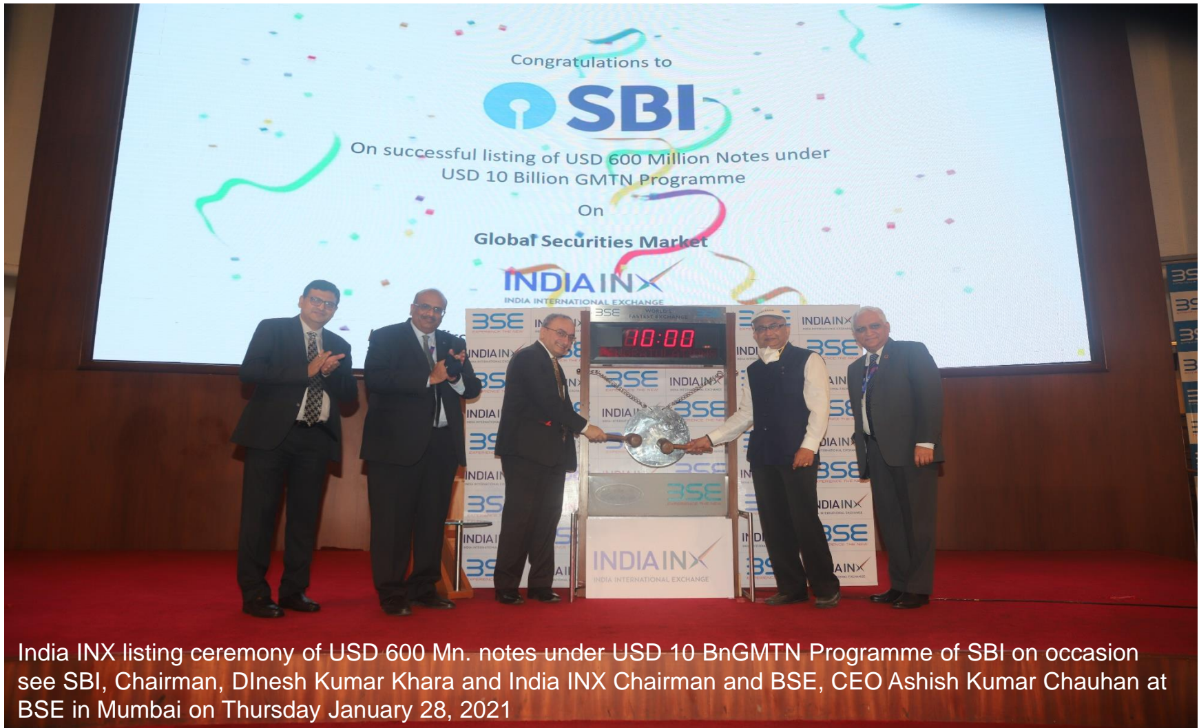
India INX listing ceremony of USD 600 Mn. notes under USD 10 BnGMTN Programme of SBI on occasion see SBI, Chairman, Dinesh Kumar Khara and India INX Chairman and BSE, CEO Ashish Kumar Chauhan at BSE in Mumbai on Thursday January 28, 2021